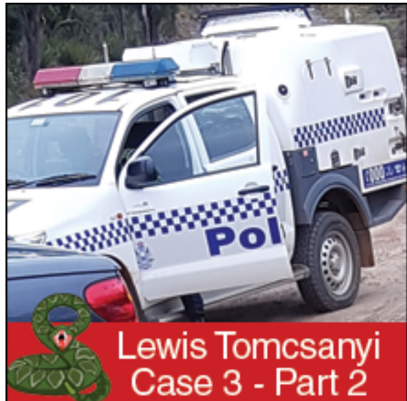
Lewis Tomcsanyi Case 3 - Part 2